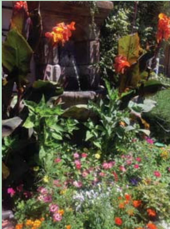
Bright orange cannas flank a fountain under-planted in a riot of colorful annuals.