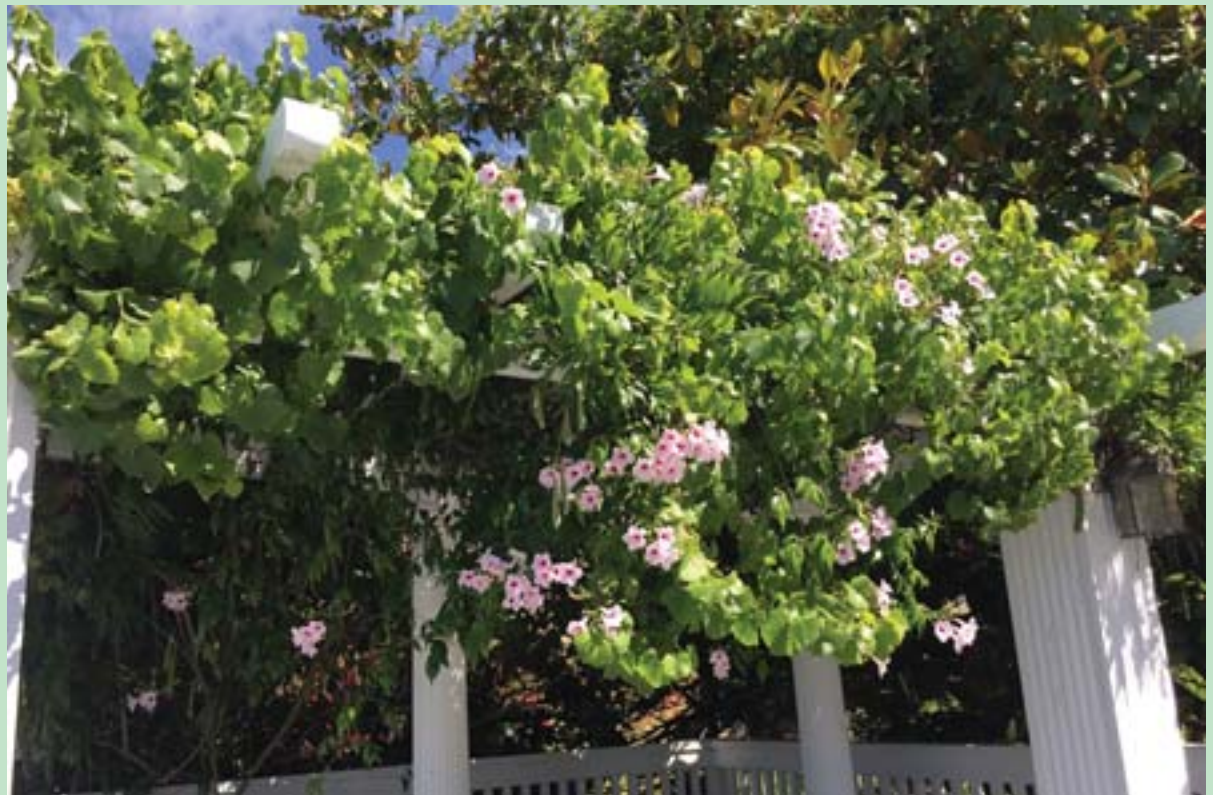
A pergola with intertwining grapes, pink bower vine, and wisteria.