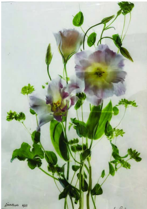
Work by Lucy Beck