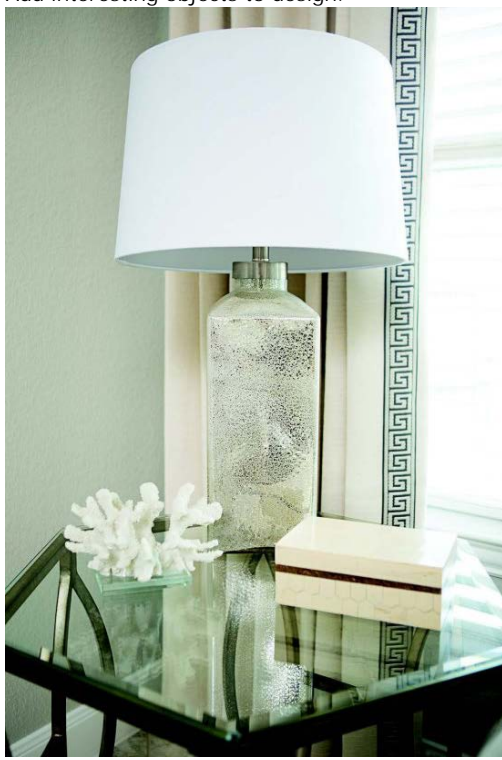
Decorative boxes offer classy touch.

Reach the reporter at: <a href="mailto:info@lamorindaweekly.com">info@lamorindaweekly.com</a>