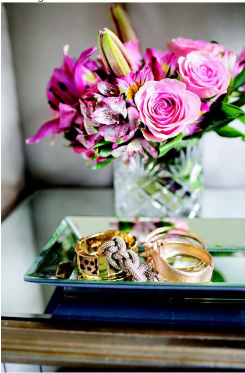
Fresh cut flowers enliven a room.