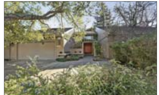
655 Cross Ridge Court $2,035,000 3 Bed 2.5 Bath 2,731± Sq Ft 0.18± Acres 655crossridge.com