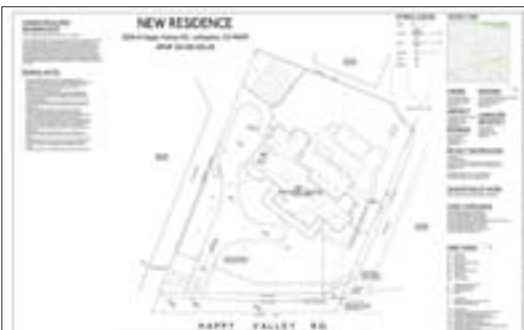
3654-A Happy Valley Road $2,000,000 Fully approved and ready to build 1.01± Acres 3654happyvalley.com