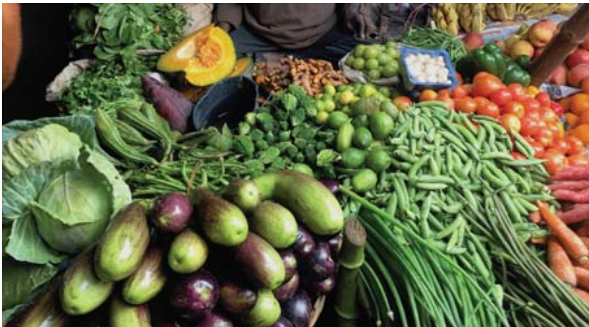
The bounty of vegetables and herbs are at their peak.