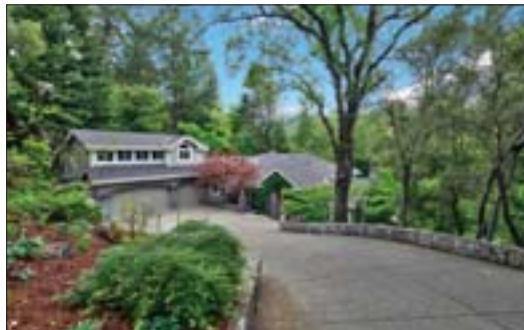
959 Sunnyhill Road $3,195,000 5+ Bed 4.5 Bath 5,100± Sq Ft 1.21± Acres 959sunnyhill.com