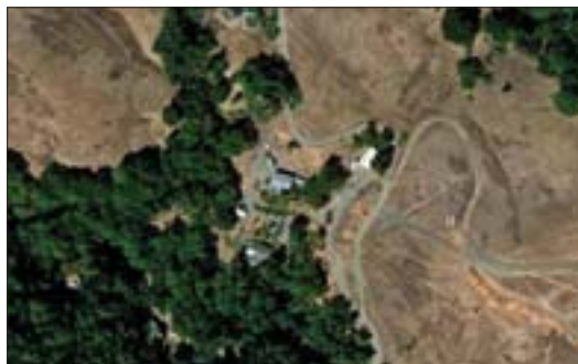
1267 Bollinger Canyon Road $1,395,000 3 Bed 2 Bath 1,600± Sq Ft 12.15± Acres 1267bollingercanyon.com