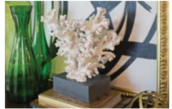
Home interior by Amanda Eck

Lamorinda Weekly Volume 13 Issue 14 Wednesday, September 4, 2019