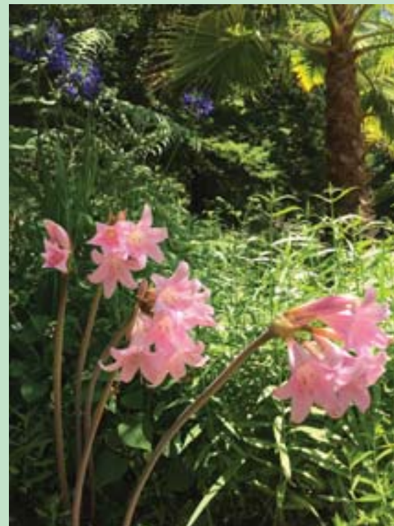
The Naked Ladies are as stunning as always with dark blue agapanthus and palms.