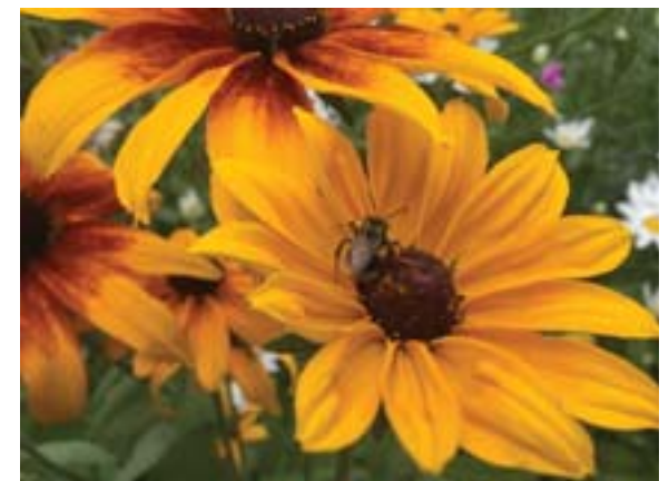
A bee pollinates a black-eyed Susan coneflower.