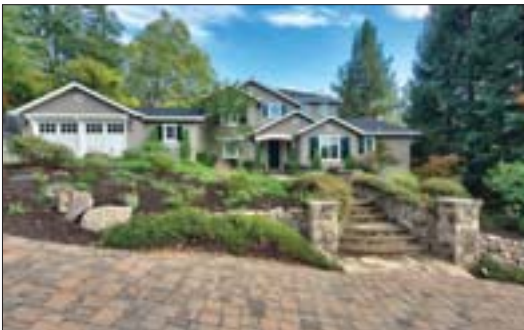
1140 Camino Vallecito $3,250,000 4+ Bed 4.5 Bath 3,716± Sq Ft 0.50± Acres 1140caminovallecito.com