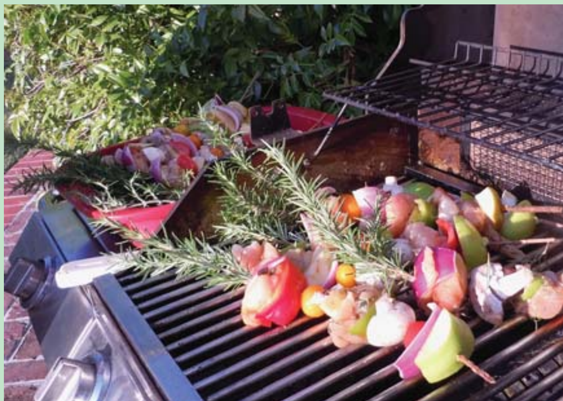
Use rosemary as skewers for grilled kabobs. Apples and Asian pears add flavor to the meat.