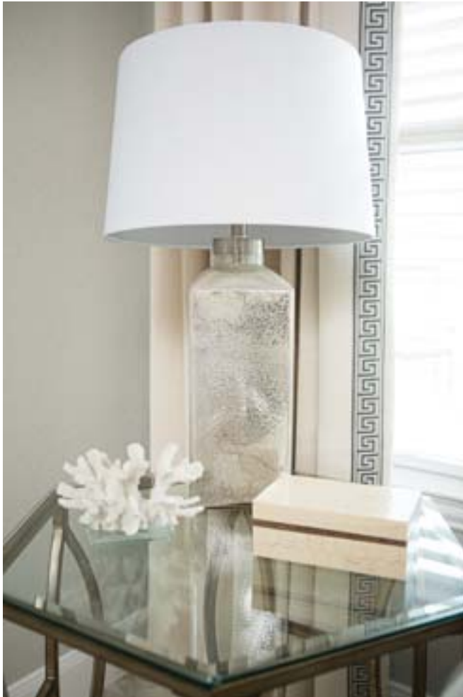
Decorative boxes offer classy touch.