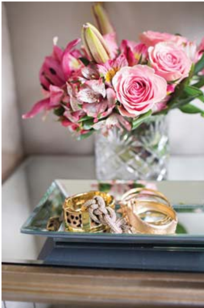
Fresh cut flowers enliven a room.