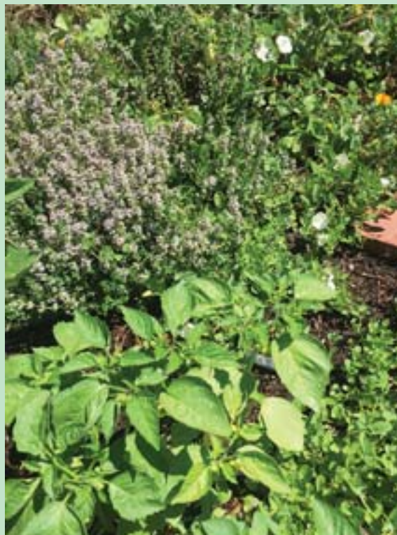
Thyme is flowering and the petals add flavor to menus.