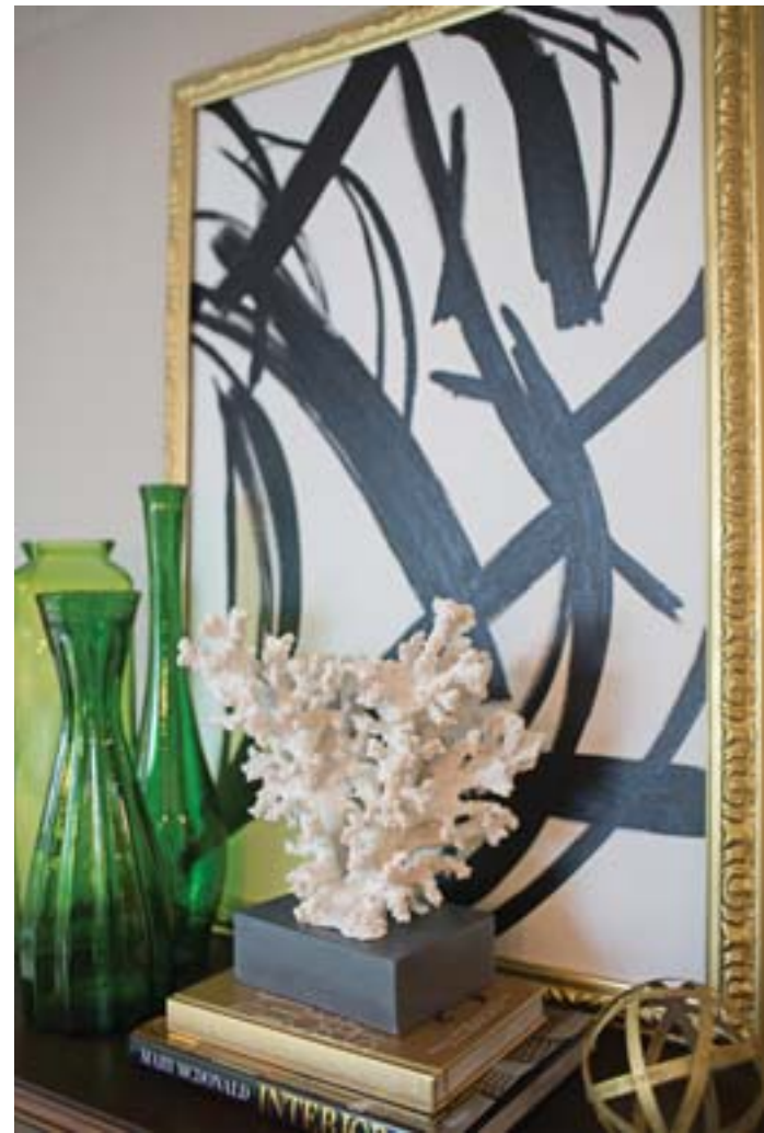
Add interesting objects to design.

I have said it before and I will say it again, fresh flowers are always a good idea. While I do admit there are some faux flowers on the market now that are realistic, keep those to a minimum and when