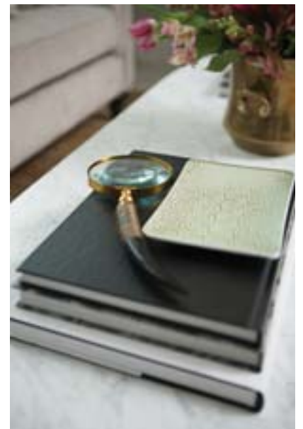
Stacking books adds interest.

Everything looks better on a tray! Trays are perfect for corralling all those little decorative items to a beautiful visual vignette. Trays come in an array of styles from wood, wicker, metal, stone, acrylic, etc. I love to place trays on coffee tables, upholstered ottomans, bedside tables, and in bathrooms. Add books, candles, and decorative objects to your tray. Make sure to have items that are varied in height and shape to keep it interesting. I love using magnifying glass, paper weights, decorative orbs,