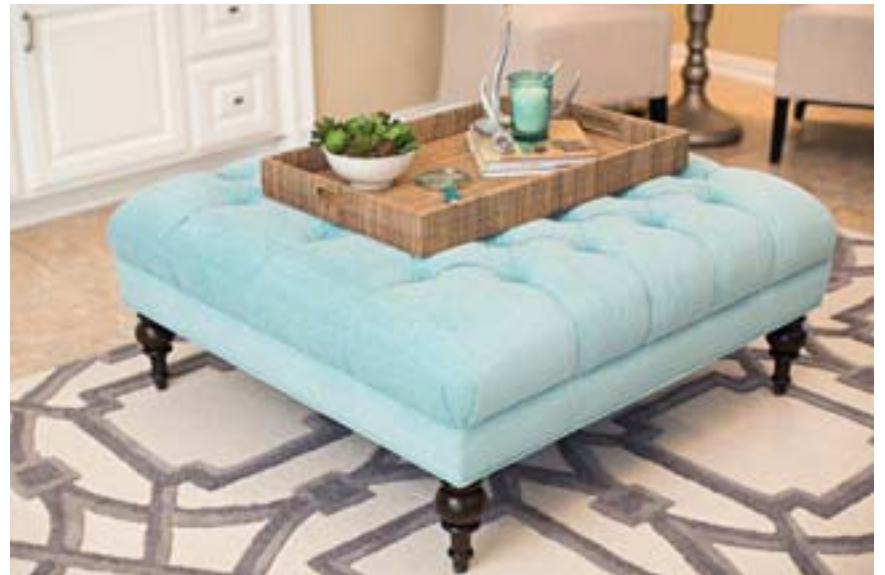
Trays allow groupings of items for display.