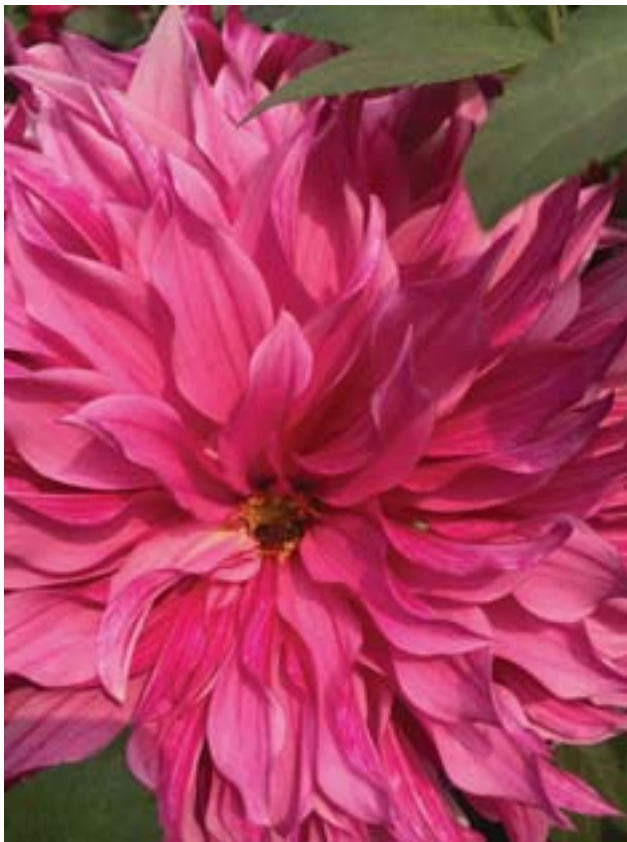
A close-up of a glorious dinner plate pink dahlia.