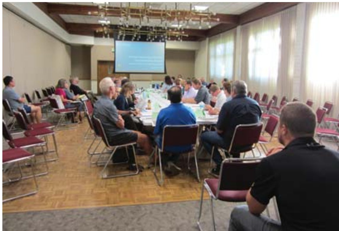
Moraga Center Specific Plan Citizen Advisory Committee Meeting No. 2