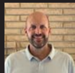
Brad Levesque Flooring