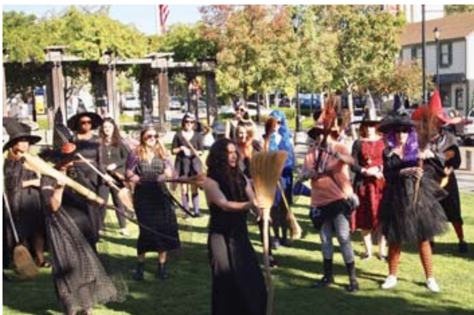
Local witches brush up their broom dance on the Plaza Oct. 5.

Halloween got off to an early start this month with a coven of witches expressing their spooky style as they rocked the broom dance on the Plaza Oct. 5 before heading out for a walk through town.