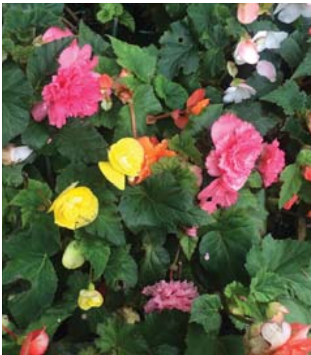
Colorful, perennial tuberous begonias should be left in the garden after their leaves die.