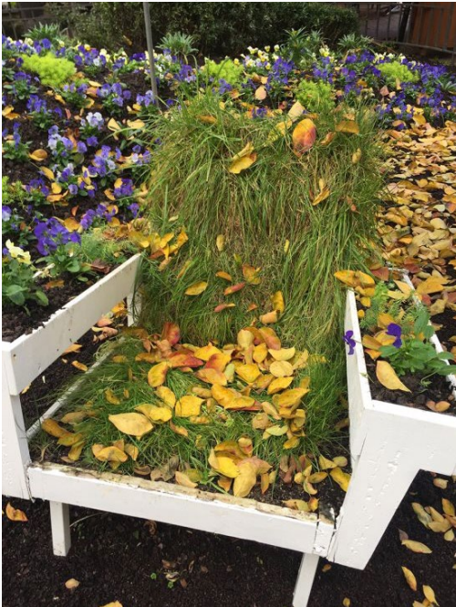
Fall leaves falling on pansies.