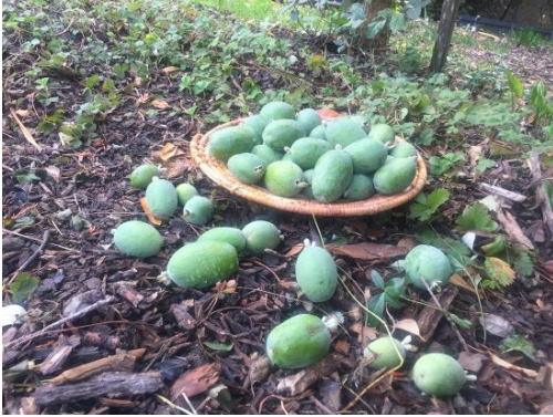
Brazilian feijoa pineapple guavas are self-harvesting. Scoop out the center to eat.