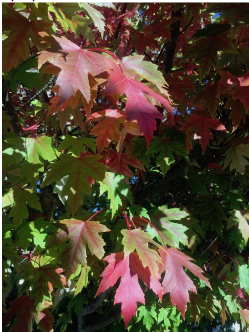
Leaves on this maple are modeling their autumn wardrobe.

"To everything there is a season, and a time for every purpose under heaven." Ecclesiastes 3:1