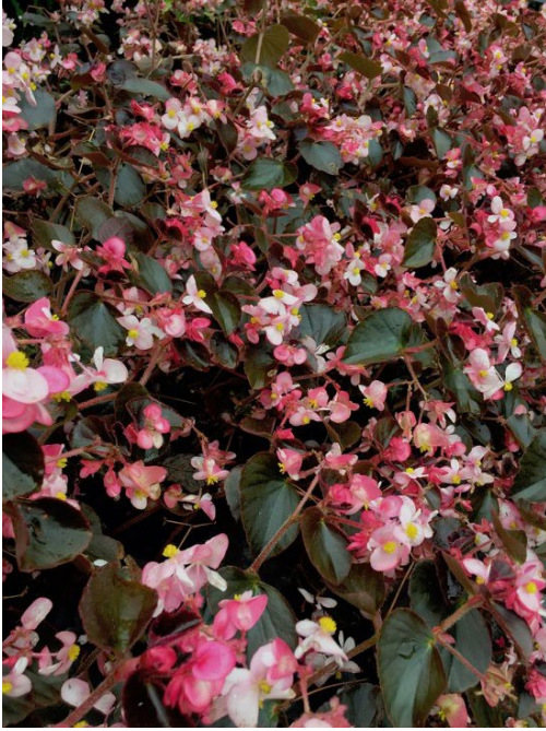
Fibrous wax leaf begonias are still blooming. When flowers fade, cut back, but don't remove.