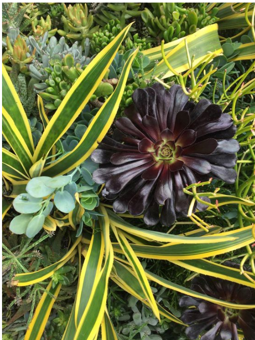
A colorful array of succulents adds drought and fire resistance to a garden.