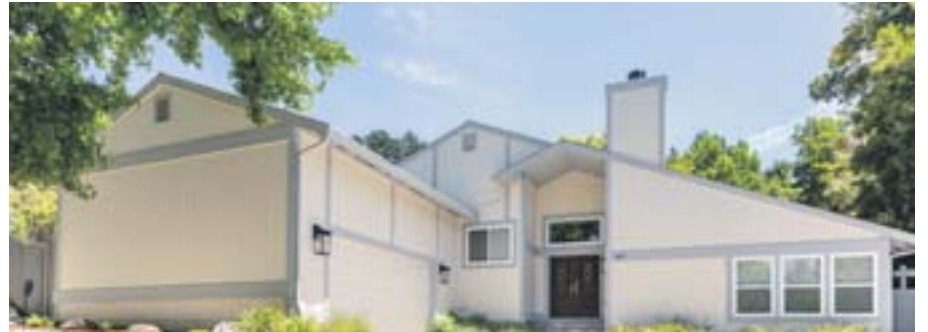
147 Donald Drive, Moraga - $1,595,000 SELLER REP