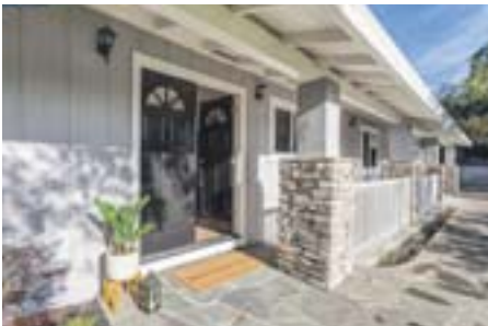
1163 Larch Avenue, Moraga $1,425,000 Buyer Rep