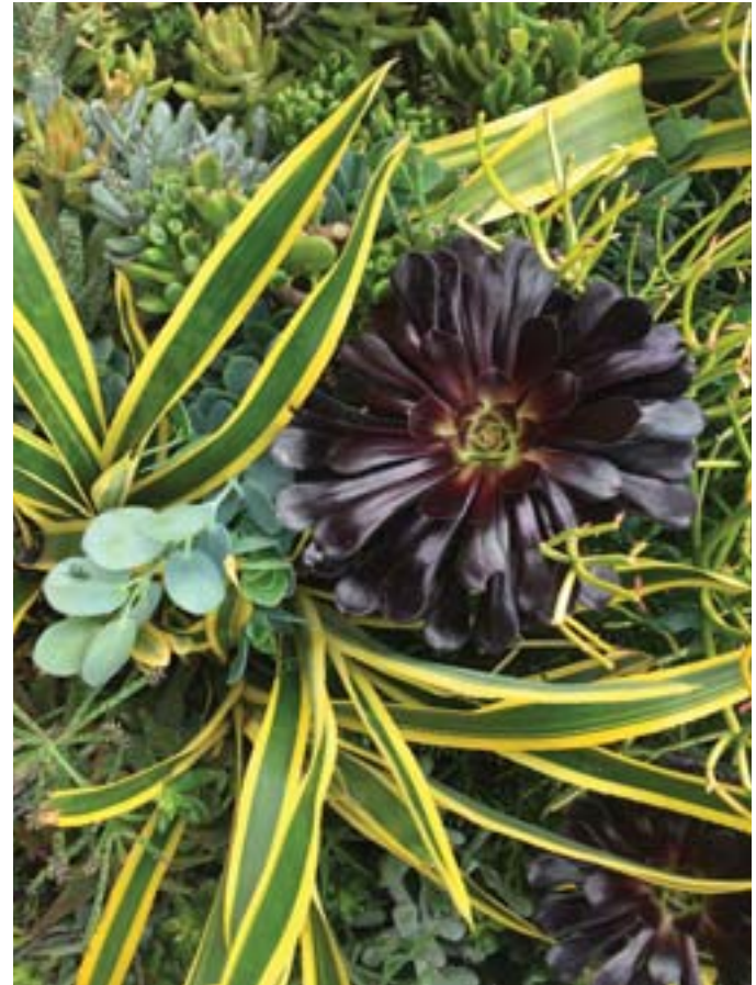
A colorful array of succulents adds drought and fire resistance to a garden.