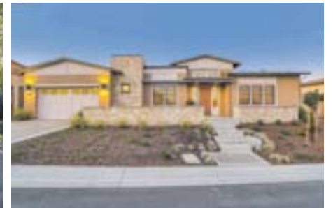
209 Sonora Road, Moraga Listed at $2,172,000 Buyer Rep