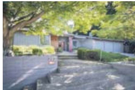
397 James Bowie Court, Alamo Listed at $1,498,000 Buyer Rep