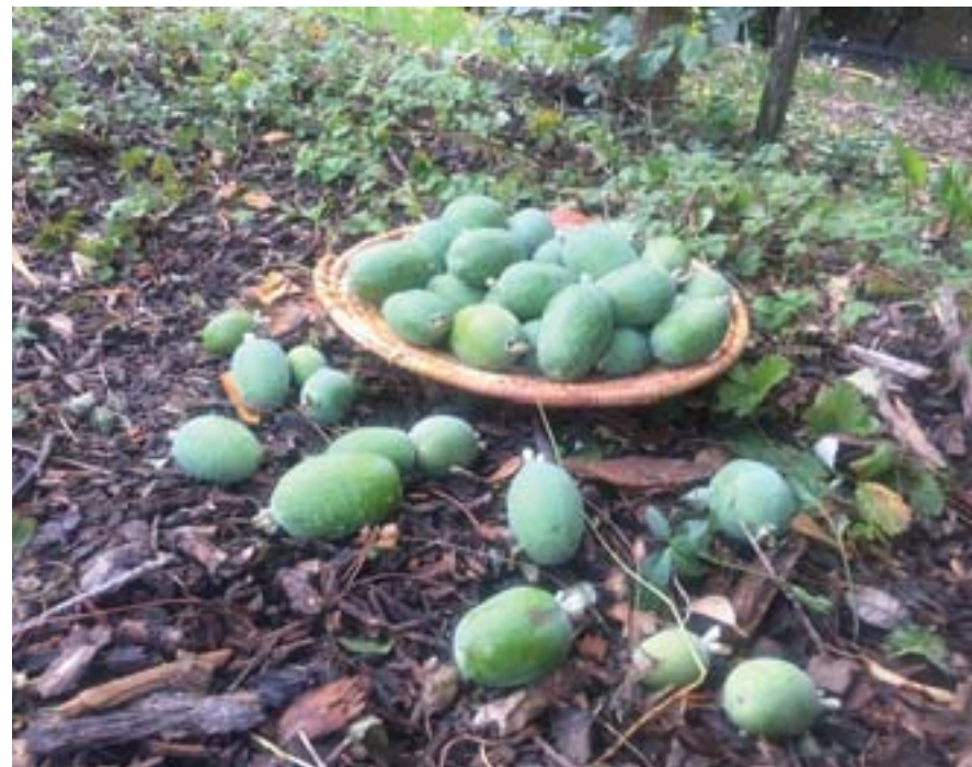
Brazilian feijoa pineapple guavas are self-harvesting. Scoop out the center to eat.