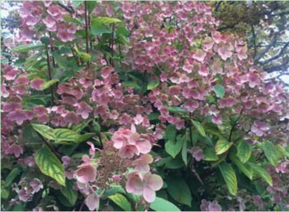
Dainty pink lace cap hydrangeas make excellent dried arrangements.