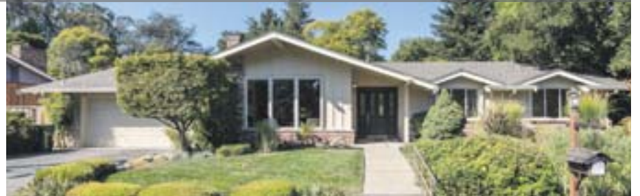
105 Devin Drive, Moraga - $1,195,000 SELLER REP