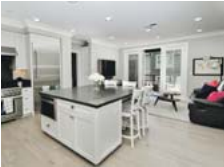
1003 Woodbury Rd. No. 207, Lafayette - $995,000 SELLER REP