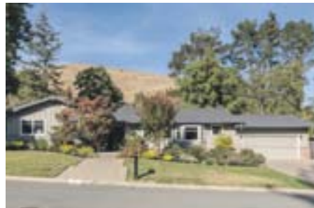
28 Lynwood Place, Moraga Listed at $1,475,000 Buyer/Seller Rep