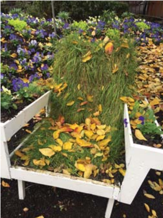
Fall leaves falling on pansies.