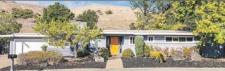
15 LaSalle Drive, Moraga - $995,000 SELLER REP