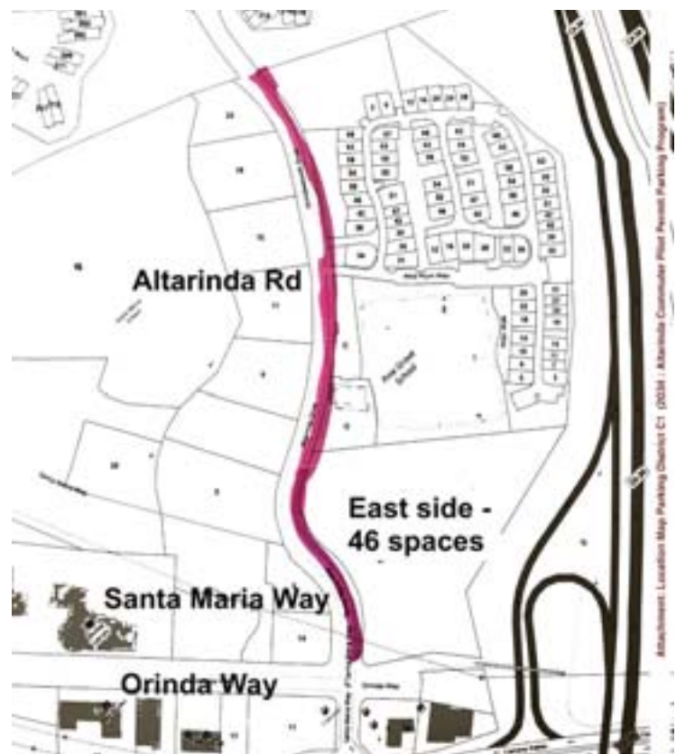
Map of proposed area.