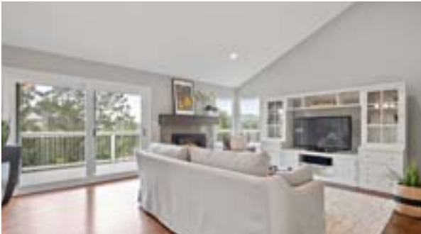
1743 Spyglass Lane, Moraga - $1,395,000 4 Bed | 2.5 Bath | 2,828 Sq. ft.

Virtual showings for every property through Matterport 3D scans, follow property links below.