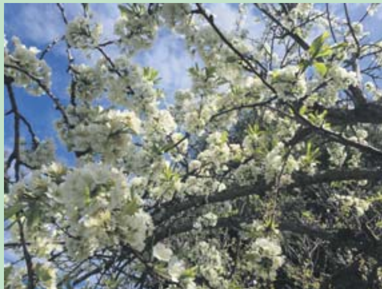
The dense white blooms on this prune tree forecast a hearty harvest.