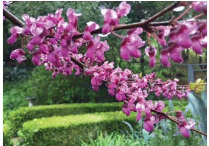
Cut a branch from a Western Red Bud tree to brighten your kitchen.