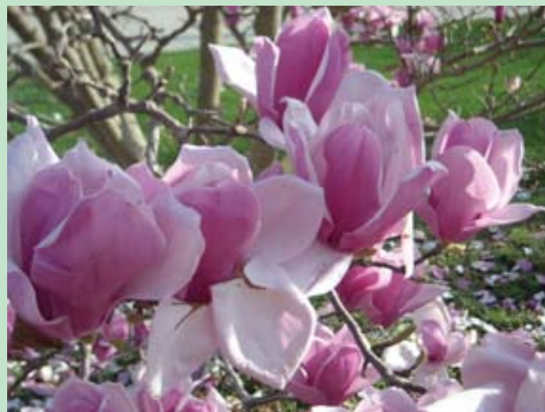
Varieties of tulip magnolias are blooming at varying times.