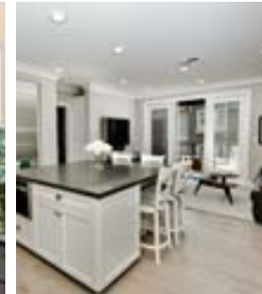
1003 Woodbury Rd. No. 207, Lafayette - $965,000 2 Bed | 2 Bath | 1,110 Sq. ft.

3D tour available at www.124ViaJoaquin.com