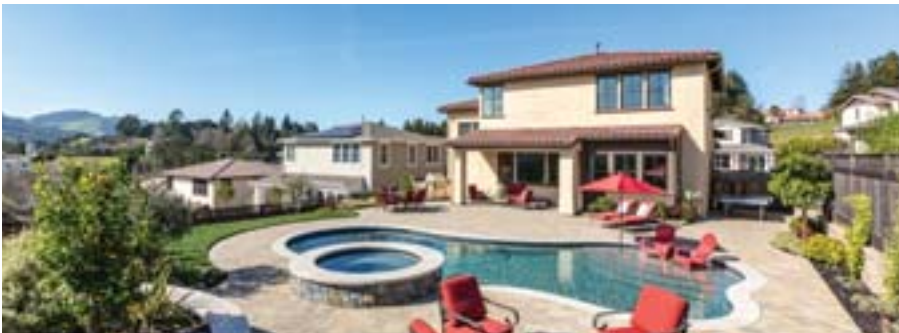
180 Willowbrook Lane, Moraga - $2,195,000 4 Bed | 3.5 Bath | 3,000 Sq. ft.

Gorgeous 4 Bed + office home in vibrant Harvest Court community. Exceptional views and super outdoor living including recently completed pool & hot tub. Beautiful open design living area with gourmet kitchen. Don't miss the 3-car tandem garage.