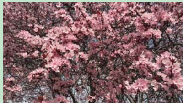
Rich rose blossoms on a flowering purple plum tree.