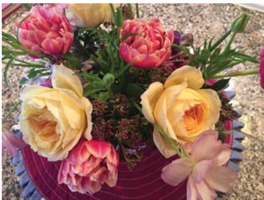
A bouquet of tulips and roses add spring joy to any room.