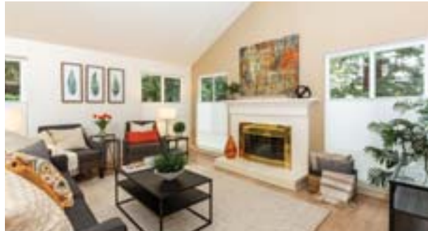
124 Via Joaquin, Moraga - $765,000 2 Bed | 2 Bath | 1,354 Sq. ft.

3D tour available at www.1743SpyglassLn.com