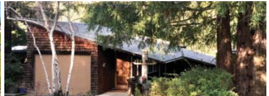
133 Donna Maria Way, Orinda - $1,595,000 3+ Bed | 2 Bath | 2,285 Sq. ft. / .24 Acres

3D tour available at www.180WillowbrookLane.com