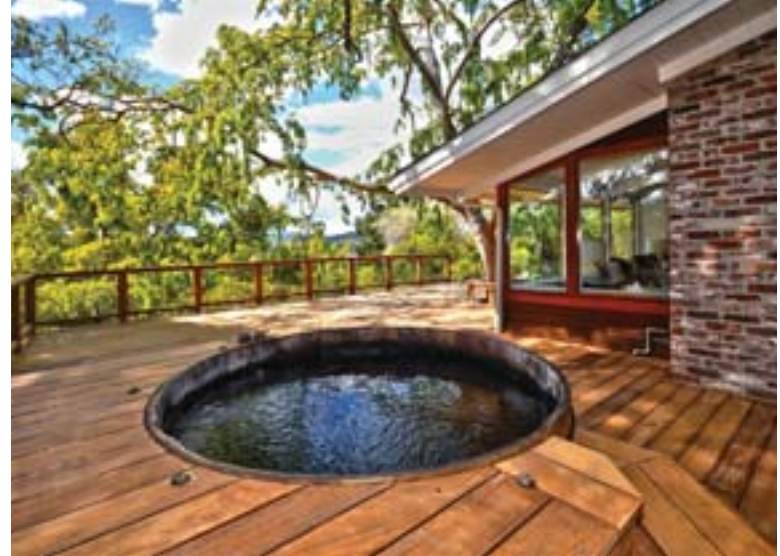
8 Vista Via, Lafayette