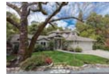
1049 Via Nueva Lafayette | Pending