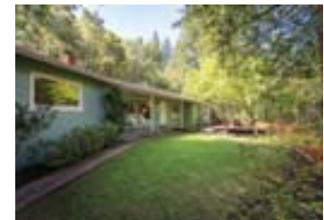
3711 Highland Court Lafayette | Sold