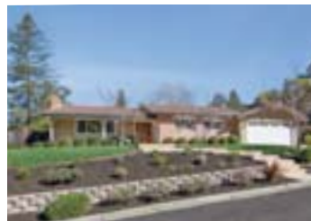
1115 Devin Drive Moraga | Sold