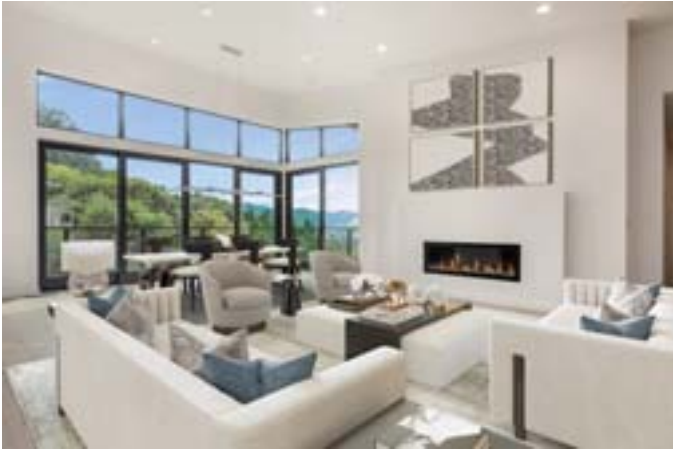
ORINDA Gorgeous New Construction 564 Tahos Road, 5BD, 4.5BA, detached guest room/office, views Offered at $2,998,000