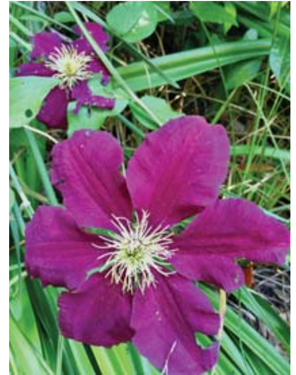
Snails snacked on Jackmanii clematis wrestled from the roses.

Stay healthy. Stay safe. Stay home. Stay grateful.