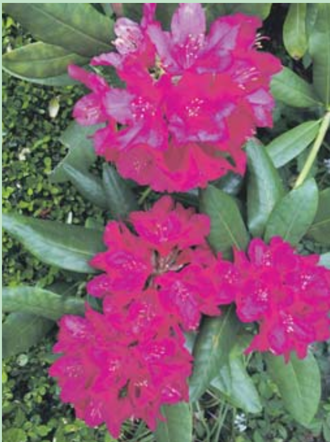
Rhododendrons burst into fluorescent bloom as the camellia flowers wane.