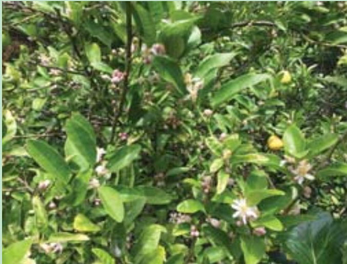
An overabundance of blossoms on citron lemon trees are perfumed bee magnets.