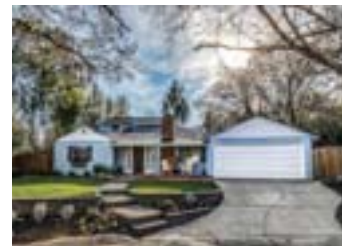
3347 Helen Lane Lafayette | Sold