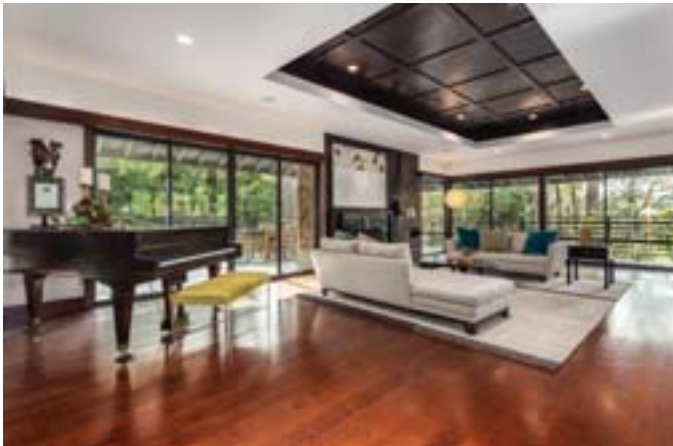
ORINDA Amazing New Price $3,198,000! Prime Country Club Location ~ 513 Miner Road 1.1 acres, 4BD, BA, guest house, 4 car garage