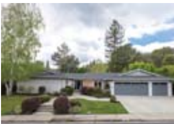
1248 Larch Avenue Moraga | Pending