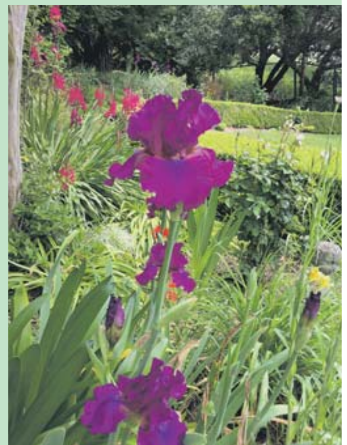
Clipped boxwood hem a parterre of bearded iris, cornflowers, roses, and daylilies.