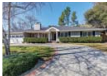
133 Lombardy Lane Orinda | Sold