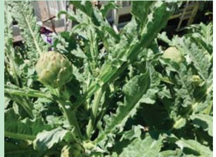
Artichokes will be ready to harvest soon.