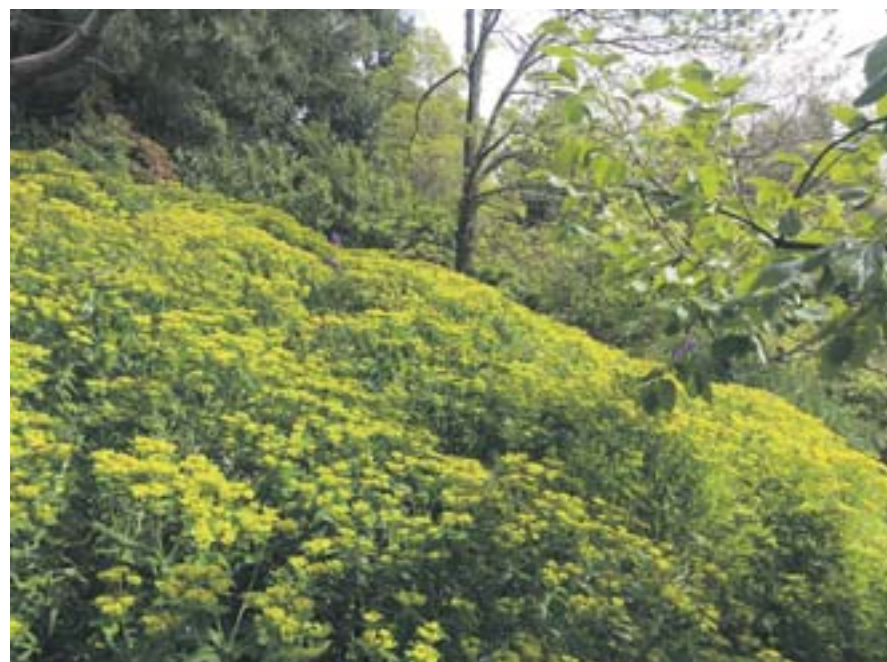
The lush hillside luxuriates in a mosaic of verdant green foliage.