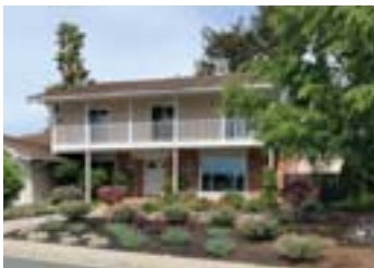
263 Calle La Mesa Moraga | Sold