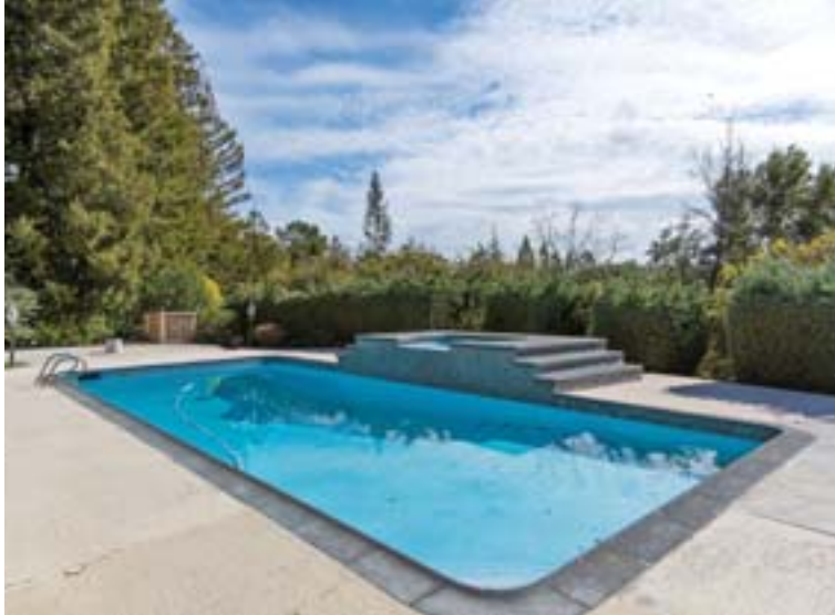
1045 Timothy Lane, Lafayette