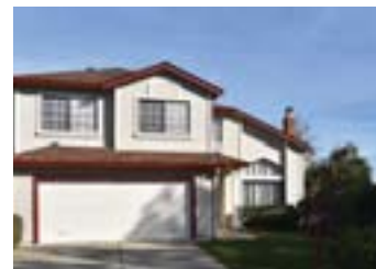
2102 Torrington Court Martinez | Sold