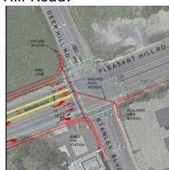
North Termination (Pleasant Hill Rd / Stanley Blvd.)

Image from Safe Route to Acalanes High School presentation, showing entry and exit from proposed bike path.