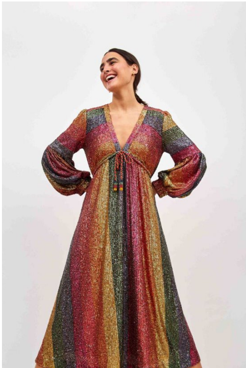
Rainbow Sequin Midi Dress by Farm Rio is available at Luck Boutique.