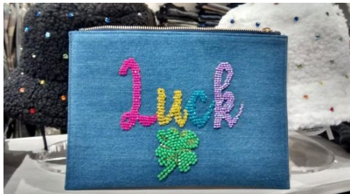
Luck Clutch

I recently attended a webinar discussion on "fashion during the pandemic" with a panel of women who work in the business; one panelist mentioned that she thought entertaining at home was going to be a big trend. She predicted that by next year designers will have a dedicated line of at-home wear. I think she's on to something.