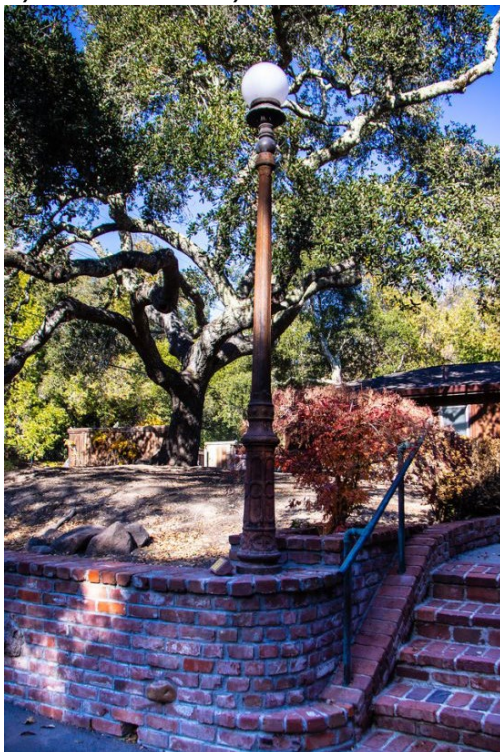
Historic cast iron lamppost was moved to 94 Tarry Ln. in Orinda.