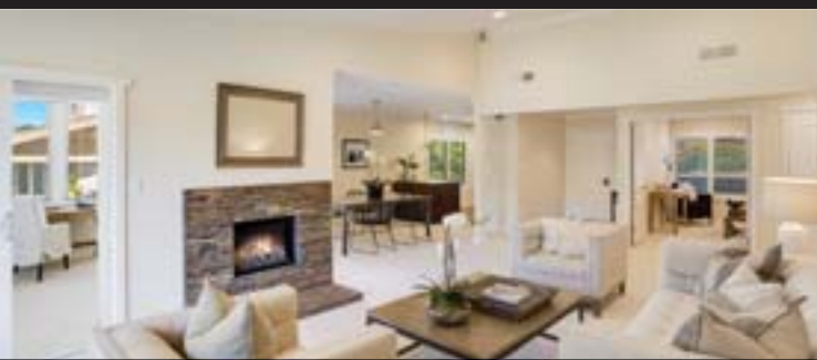
2095 Cactus Ct #3 | Walnut Creek | $899,000 | 2095Cactus.com