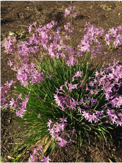
Purple society garlic is deer-resistant and blooms in winter.