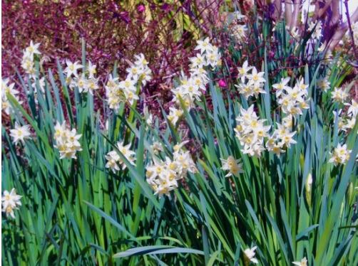
Pick a few sprigs of narcissus to perfume an entire room.