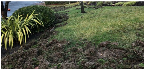
Damage to a lawn from the wild boars invading neighborhoods.