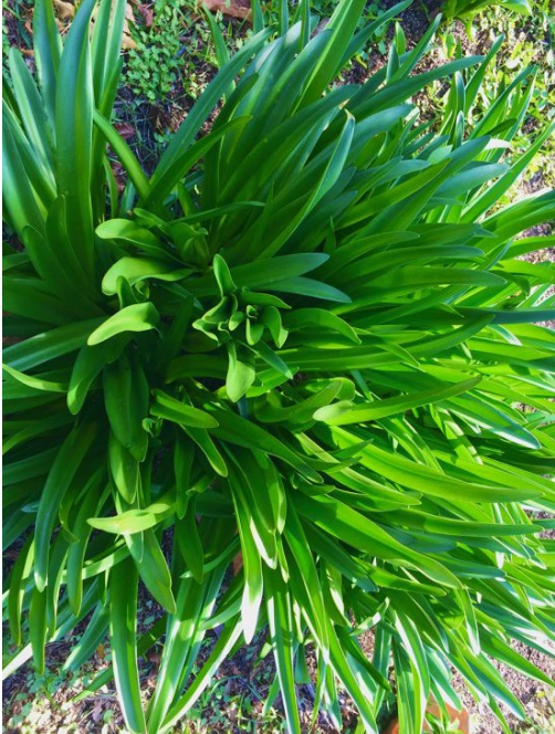
The bright shiny foliage of Naked Lady adds green to a bare yard.