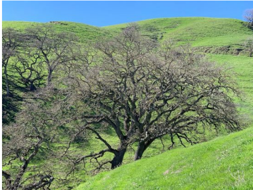
Recent view from the Lafayette Ridge trail Lafayette Ridge Trail: Part of Briones Regional Park, this scenic trail begins above Acalanes High School and follows the ridgeline for about 3 miles up and down, intersecting with dozens of other trails along the way. Enjoy sweeping views at every angle with vibrant rolling green hills this time of year (without much shade).