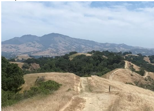
View of the many hills on Lafayette Ridge from the Springhill to Buckeye Ranch Loop Springhill to Buckeye Ranch Loop: Also part of Briones Regional Park, the steep incline of this trail (if you start on the left side at trailhead) pays off with breathtaking views at the top where the loop meets Lafayette Ridge.