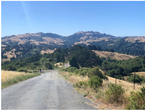
View of Moraga hills on Mulholland Ridge Mulholland Ridge: This wide, mostly paved ridgeline trail from Moraga to Orinda offers unobstructed views of the Moraga hills as well as Mt. Diablo.