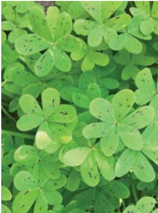
The trinity of leaves of the shamrock.