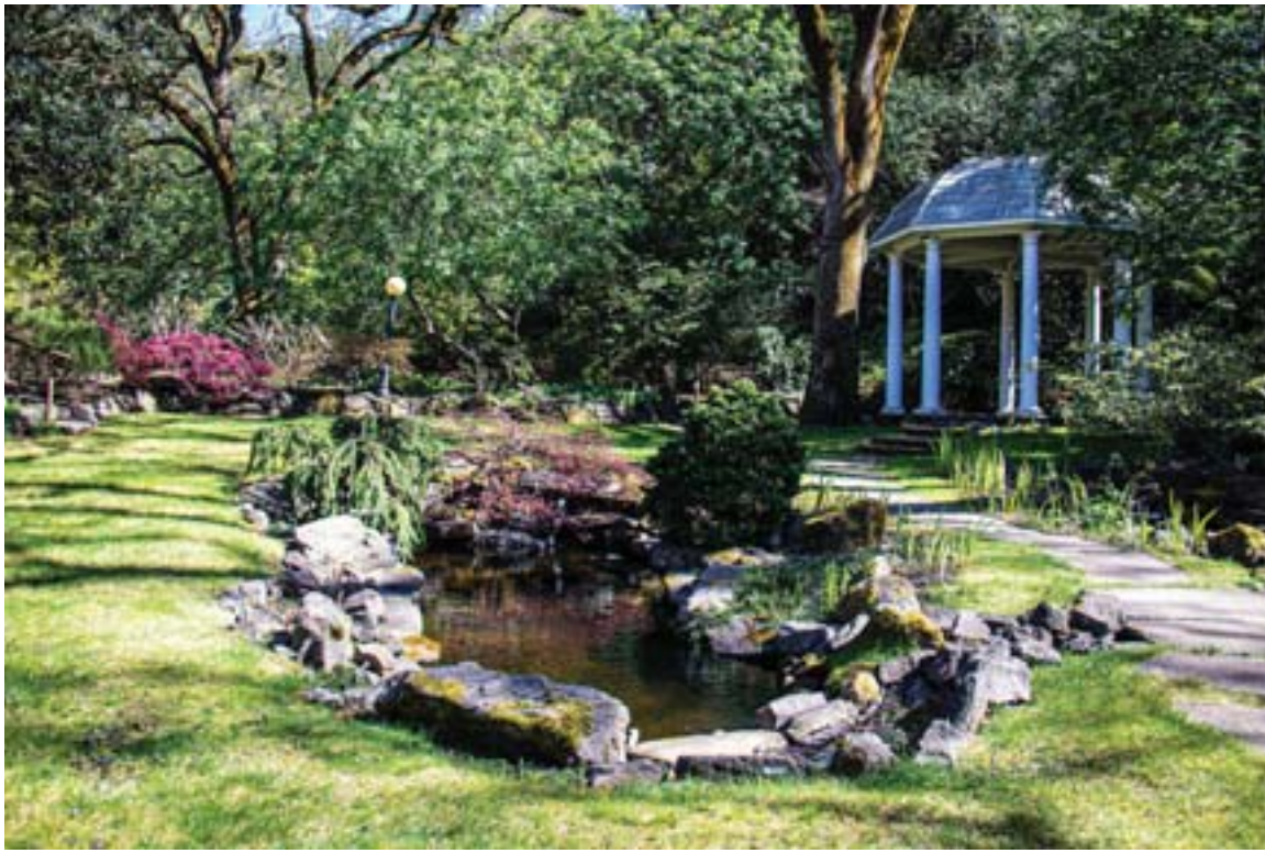
Pool and gazebo in upper garden.