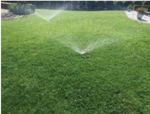
Watered lawn grasses provide a defensive zone.