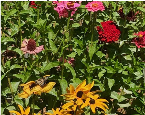
This Monarch fluttered from zinnias to Black-eyed Susan flowers.