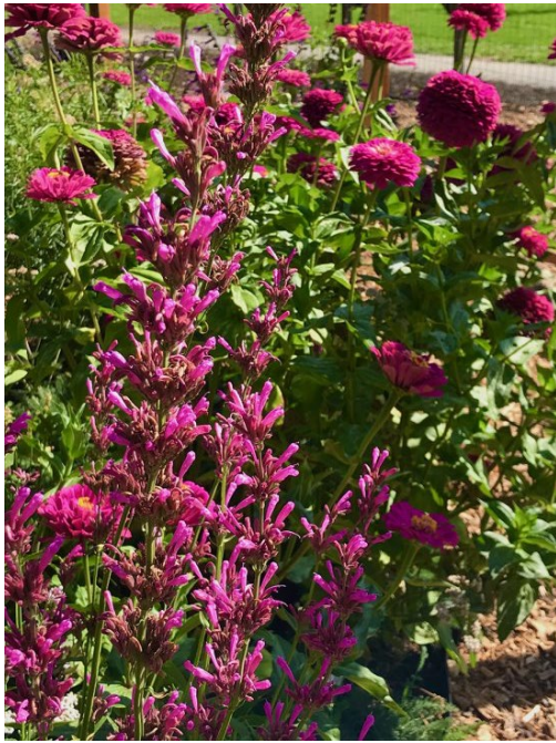
Purple Agastache and purple zinnias at the Moraga Butterfly Garden.