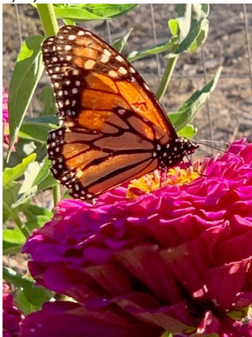
A majestic monarch lands on a zinnia.

"If a butterfly flutters its wings in Brazil, could it cause a tornado in Texas?" ~ Edward Lorenz, meteorologist