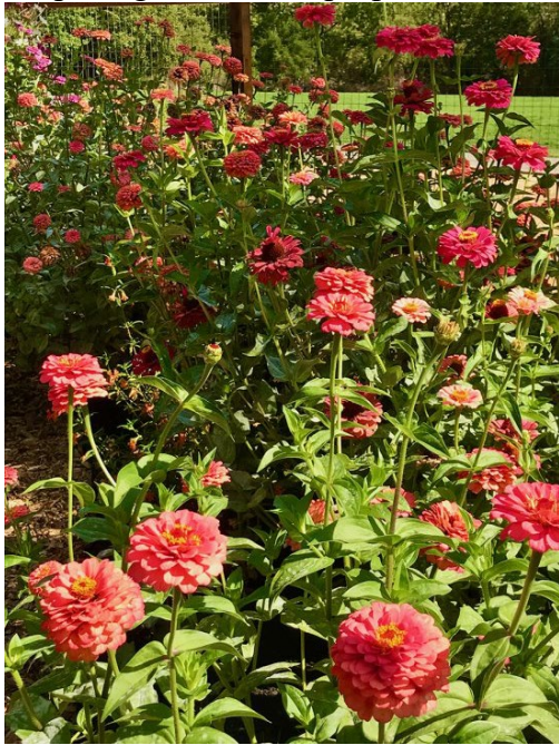
Salmon zinnias in the Monarch Garden.