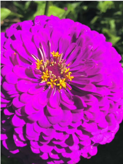
A close-up of a gorgeous deep pink zinnia.