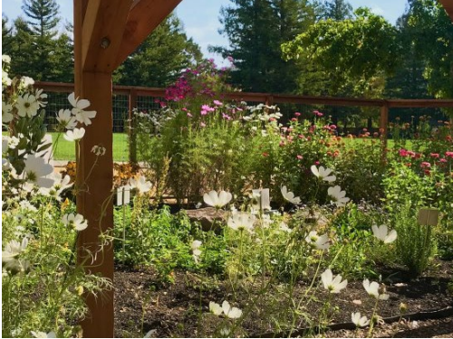
The pergola provides a centerpiece and shade for the fenced garden.