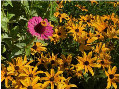
A heart of love on a zinnia shines brightly blooming with the Black-eyed Susan.