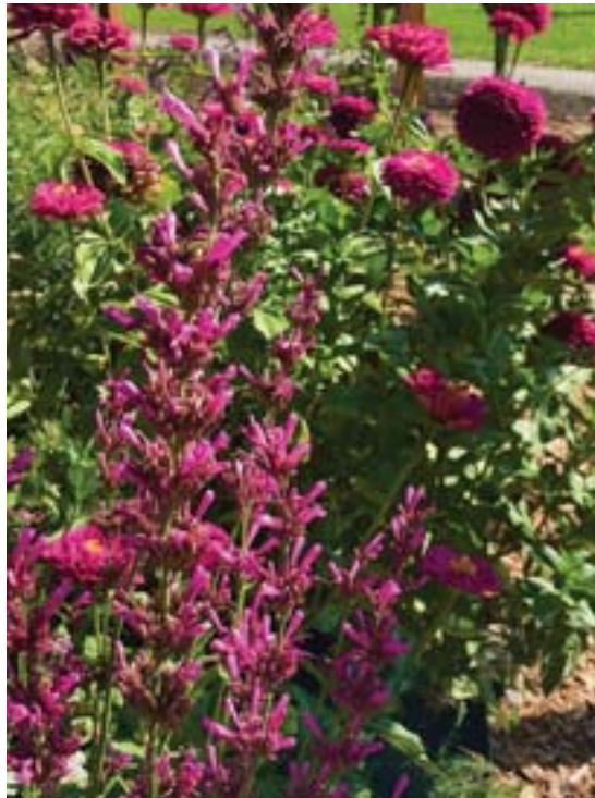
Purple Agastache and purple zinnias at the Moraga Butterfly Garden.