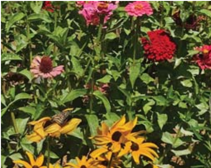
This Monarch fluttered from zinnias to Black-eyed Susan flowers.