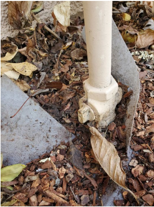
Gas shutoff valves