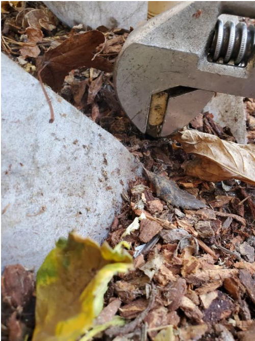
Gas shutoff valves can be closed with a wrench