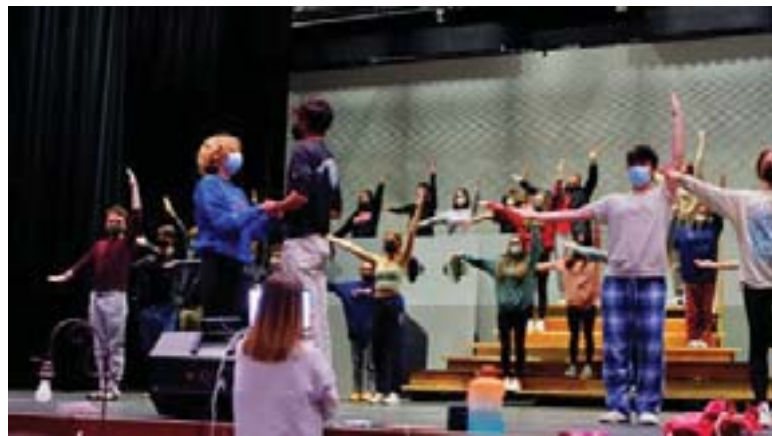
Rehearsal for Campolindo's "Cinderella"