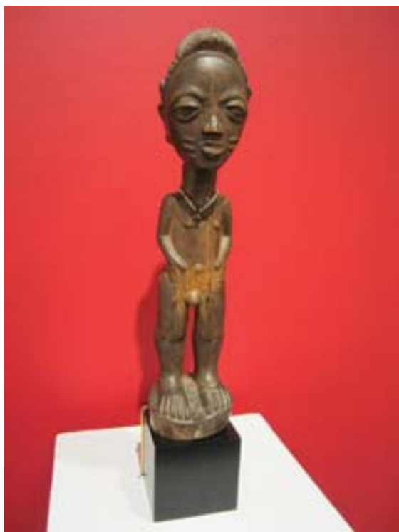
Mid-20th Century "spirit spouse" from Republic of Cote d'Ivoire "Blolo Bian"