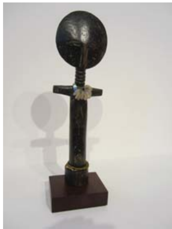
Mid-20th Century fertility figure from Ghana "Akua Ba"