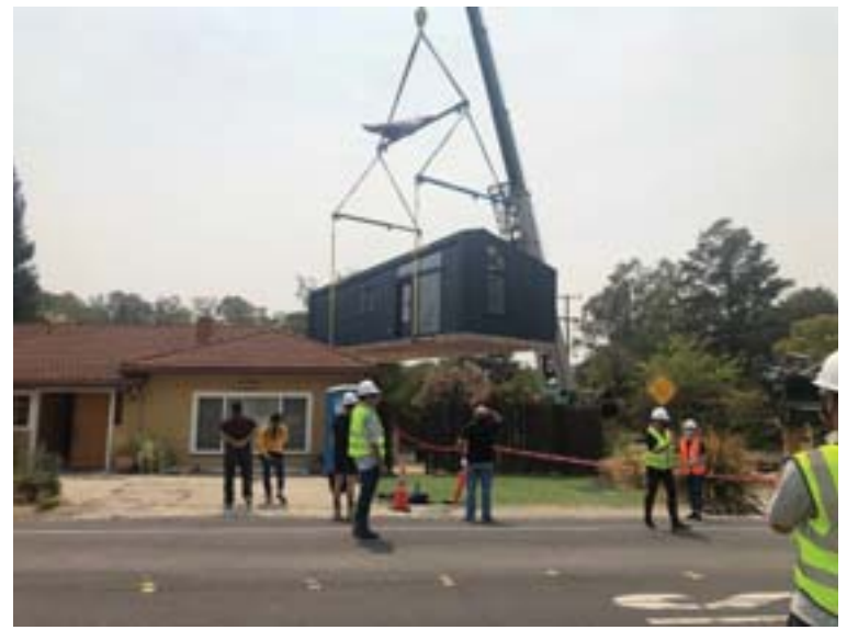
City of Lafayette sees increase in ADU permits.

Council members requested staff include detailed information in the narrative of the Housing Element about outreach made directly to BART regarding potential development, as well as how RHNA numbers were much higher per capita to