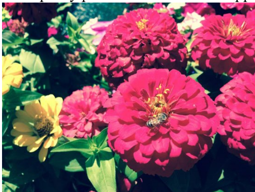
Bees love zinnias, too!