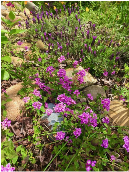
Drought-resistant lantana and lavender will bring the pollinators.