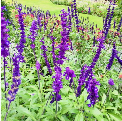
Blue salvia is a preferred food source.