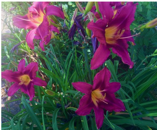
Daylilies attract hummingbirds