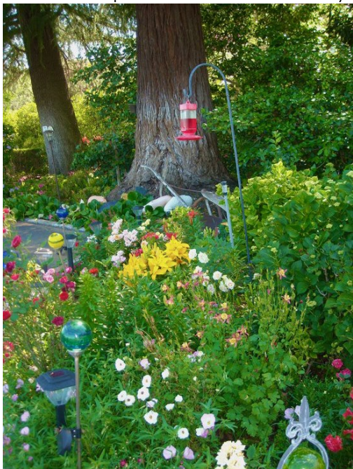
A hummingbird paradise.