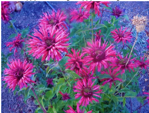
Bee balm is a favorite for hummers.