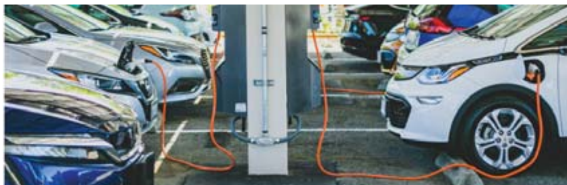
CCTA is developing an electric readiness program