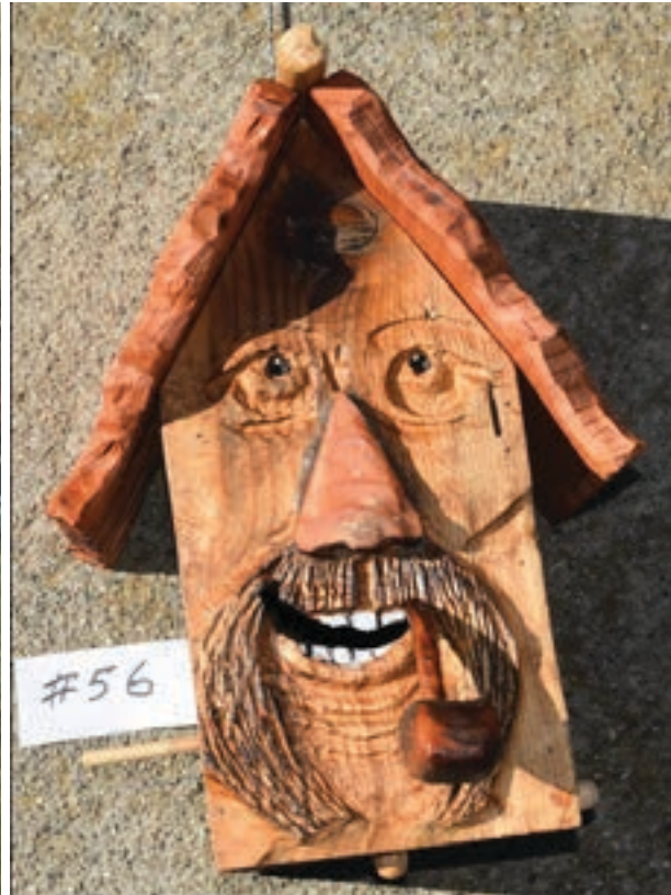
Doug Crooks: Wood Spirit Bird House