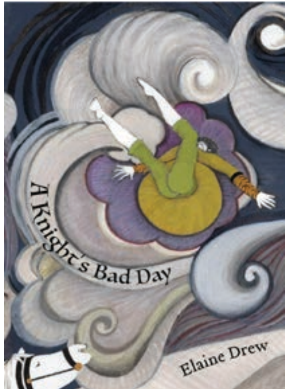
Cover illustration by Elaine Drew for her graphic novel: The back and front cover of the graphic novel, "A Knight's Bad Day," 14" x 10" gouache painting