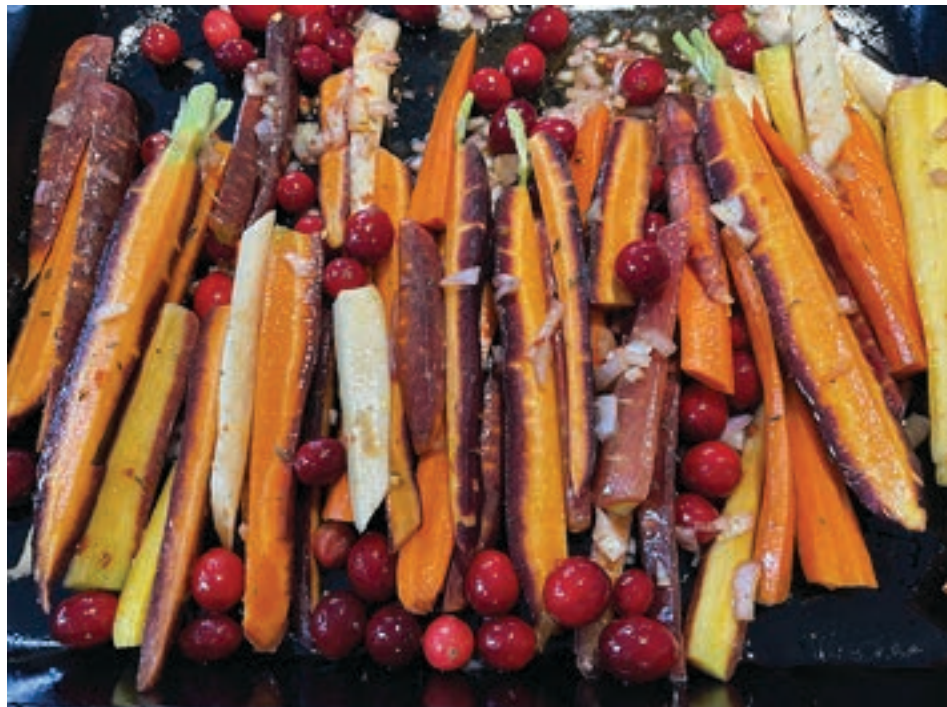
Roasted Rainbow Carrots & Cranberries