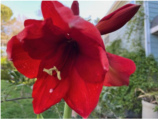
A red amaryllis flower.