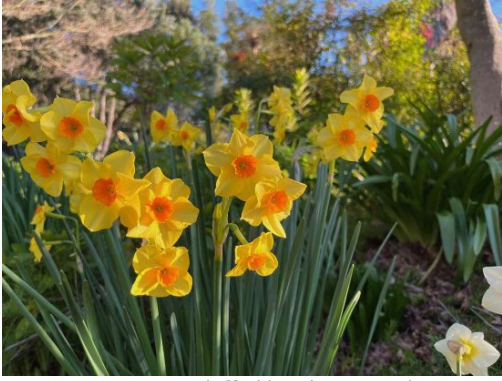
Fragrant Peter Pan daffodils.

Happy Gardening. Happy Growing. March in. March on.