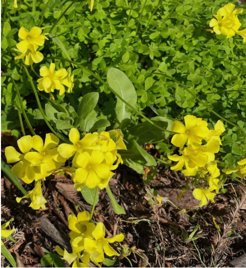
Yellow oxalis is also called shamrock.