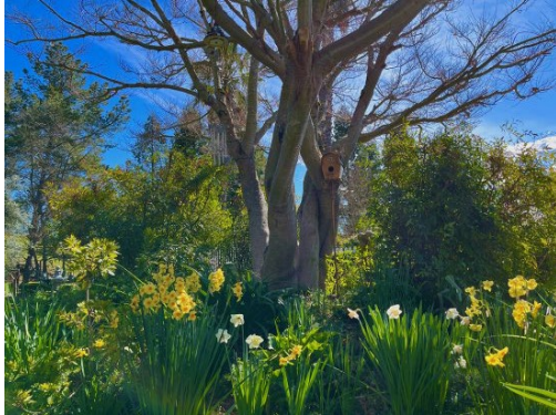
The sun shines on a winter view of a Japanese maple with daffodils at the base.