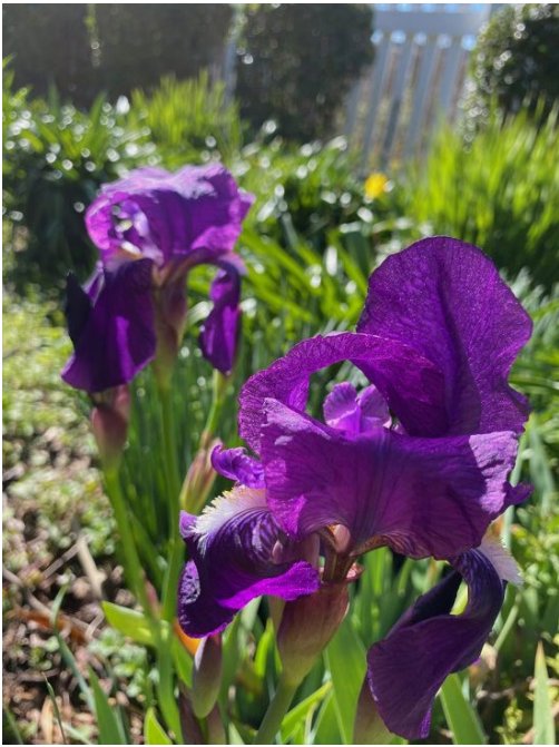
Purple bearded iris glisten in the garden.