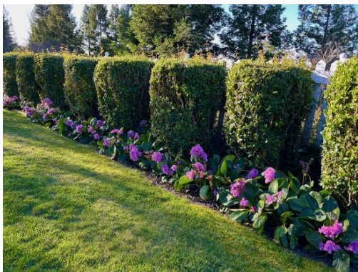
Bright pink Bergenia provides a colorful understory to manicured privet along a fence.