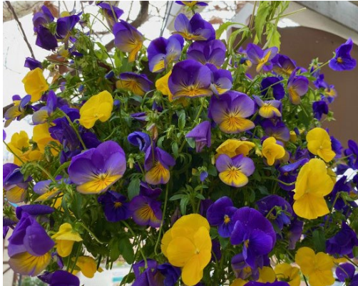
Hang a basket of violas for instant color and a pop of excitement.

Happy Gardening. Happy Growing. Happy St. Patrick's Day!