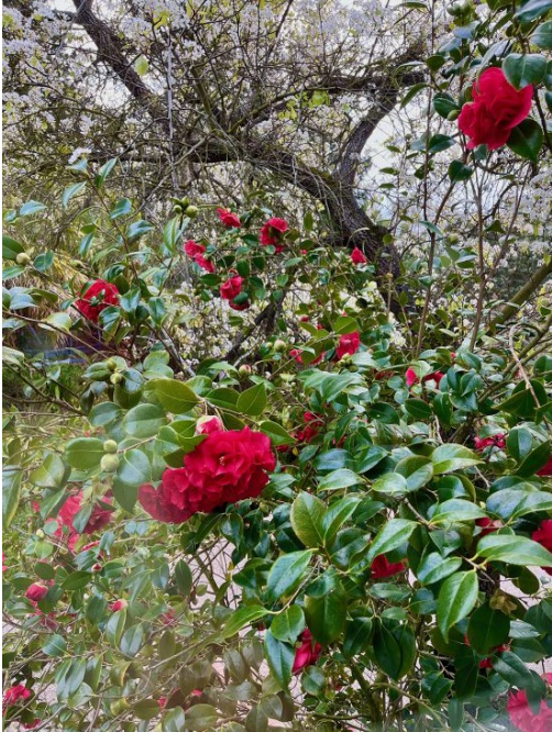
A gorgeous combination of flowering pear and camellia trees.