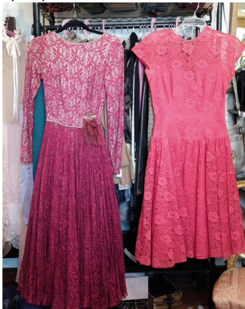
Dresses in shades of Magenta available at Divine Consign.

Viva Magenta is the color of the year, says Pantone Color Institute, the company behind the standardized color matching system. Magenta comes from the red family and it is described by Pantone as a shade with "vim and vigor" and is "expressive of a new signal of strength." Inspired by nature, more specifically the cochineal beetle, Viva Magenta is meant to reflect strength, power, and compassion in our ever more stressful and challenging world.