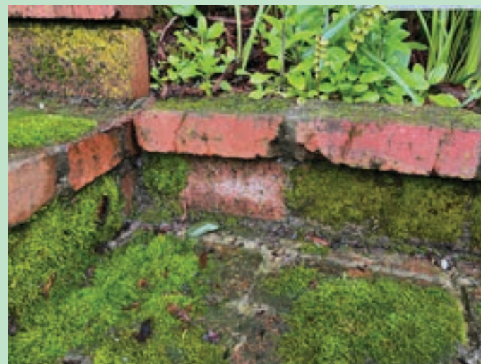
Because of the rainy weather, moss grows on the brick stairs.