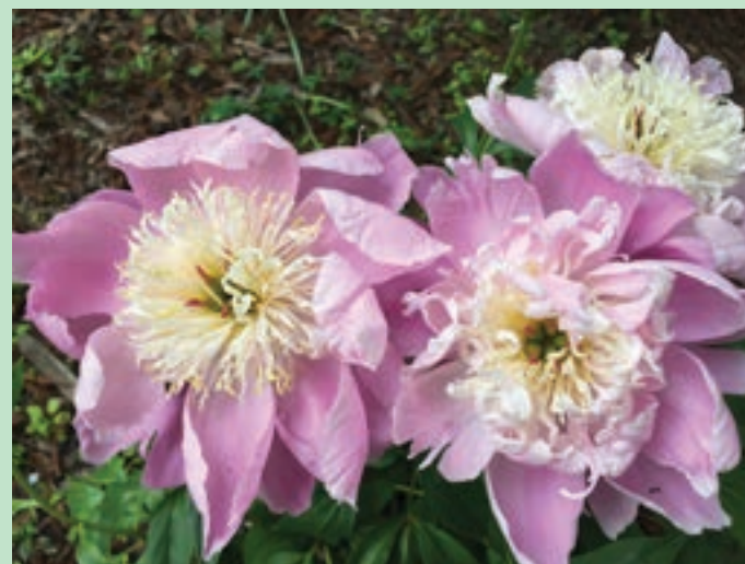
Peonies add a power punch and make beautiful bouquets.