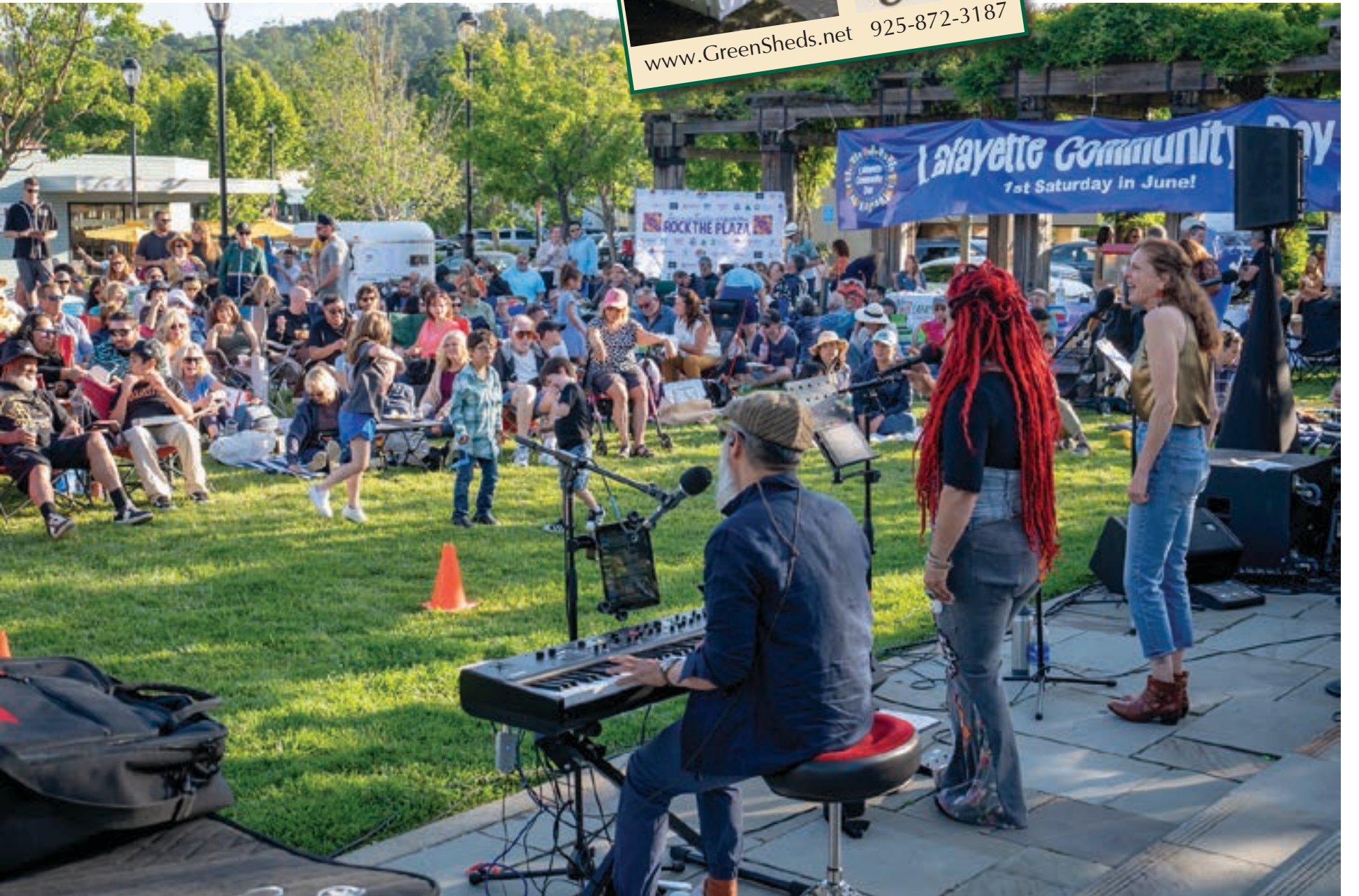
The band Sausalito performs June 2 at Rock the Plaza in downtown Lafayette.