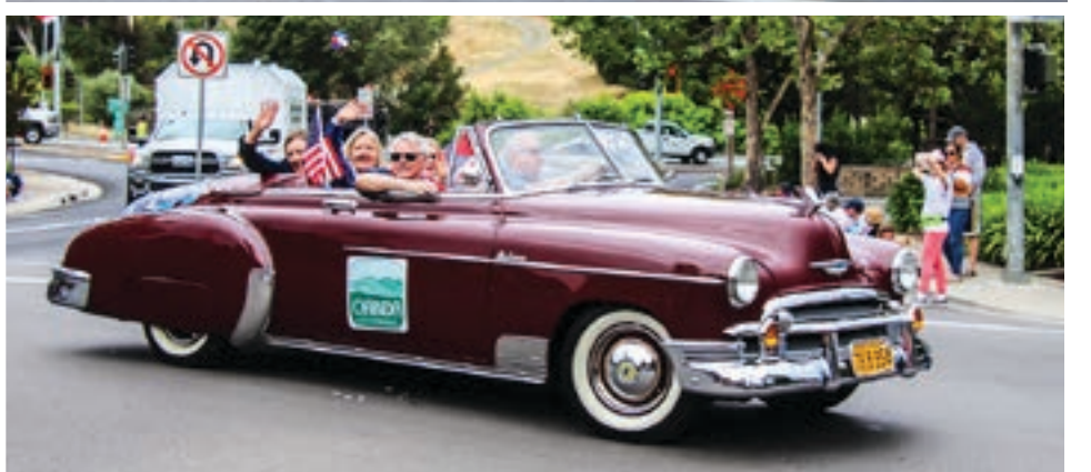
Last year's Fourth of July parade in Orinda featured marching bands, horse-drawn wagons, stilt walkers and much more.