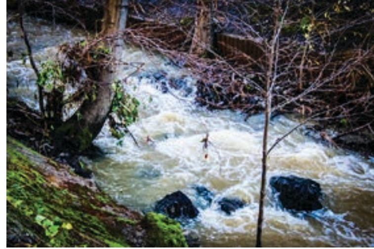
San Pablo Creek