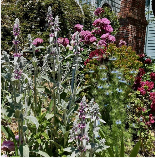
A plethora of blooms including lamb's ear, roses, mint, and nigella.

https://www.bethestaryouare.org/shoedrive