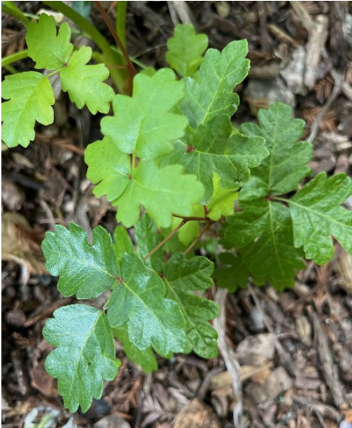
The lime green leaves of newly sprouted poison oak are sprouting in gardens.