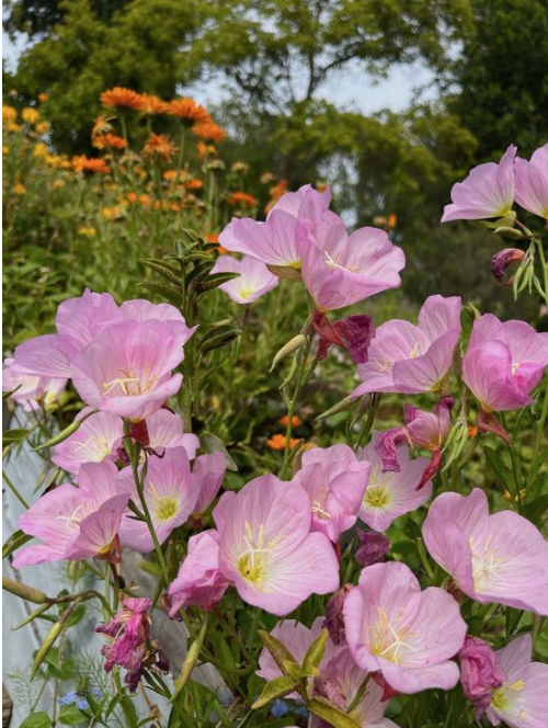
Mexican primrose and calendula bloom in July.