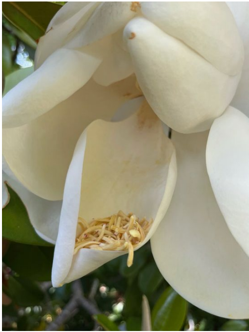
A bee just left the big magnolia blossom's nectar.