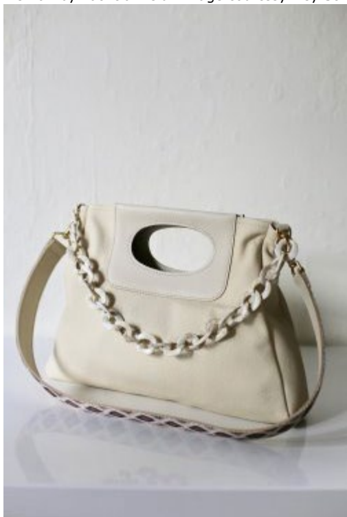
The Cassie in Imperial Dune

Reach the reporter at: info@lamorindaweekly.com