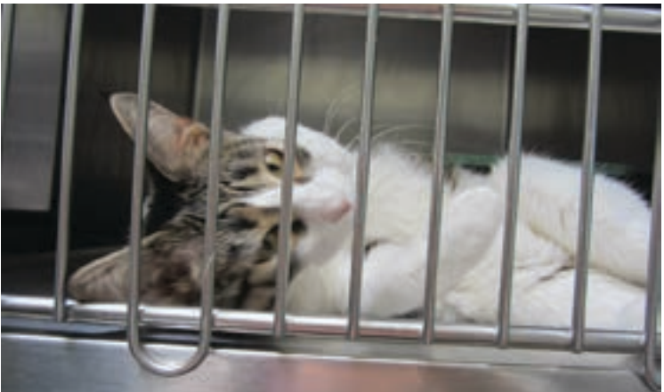
Feral cat tries to play with reporter's camera.