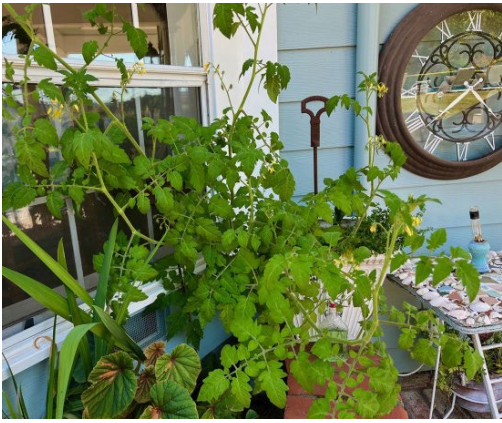
Cherry tomatoes growing in a container with thyme and peppers.