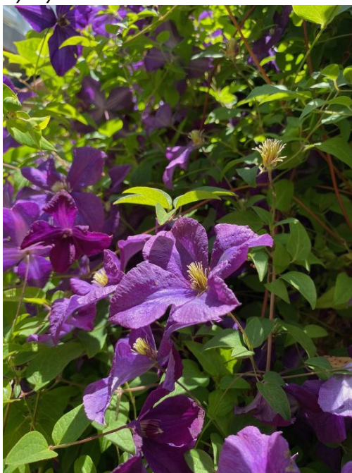
Cezanne Clematis is a true painter's dream climbing vine.