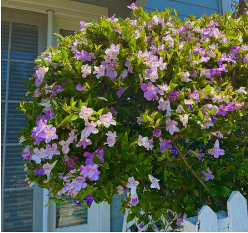
Purple trumpet vine and potato vine twine together.