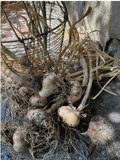
Fresh garlic was harvested and will be dried for 30 days before consumption.