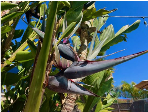
For a tropical look and summer stunner, the blue-flower bird of paradise is a winner.