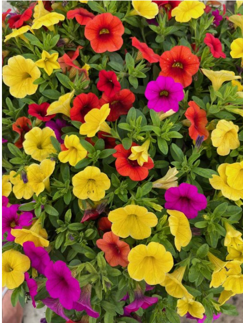
Calibrachoa called Seaside petunia is a colorful fall addition.