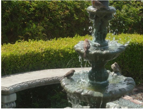
Birds splash in the gurgling fountain

Happy Gardening. Happy Growing. Happy Fall Flying!