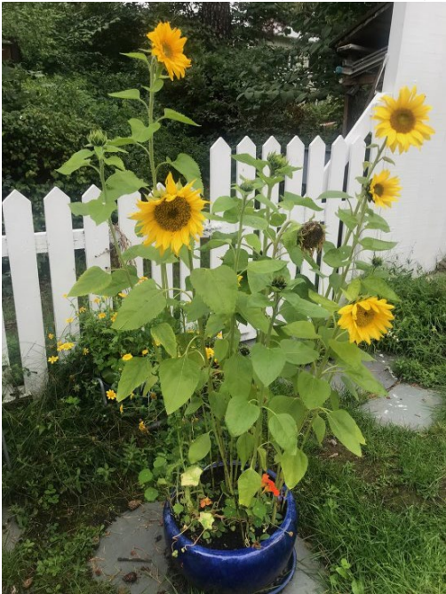
Save the seeds of sunflowers to plant and to feed the birds.