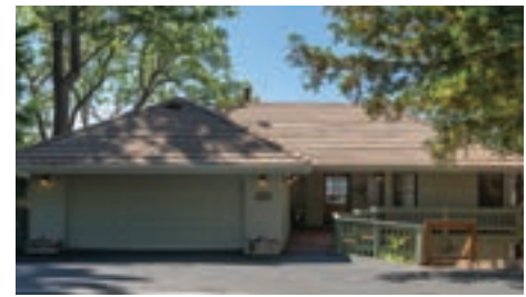
1230 Heather Drive Represented Buyer