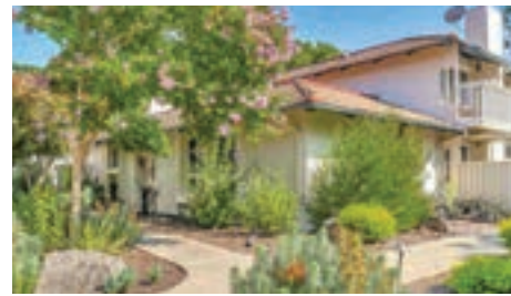
1457 Camino Peral Represented Buyer