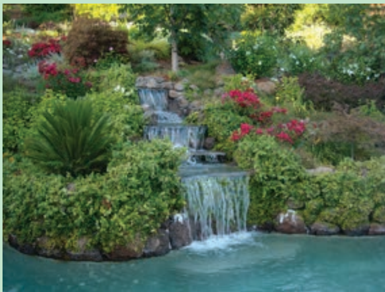
Rocks and stones anchor this spectacular waterfall and pool.

Happy Gardening! Happy Growing. Happy Halloween!