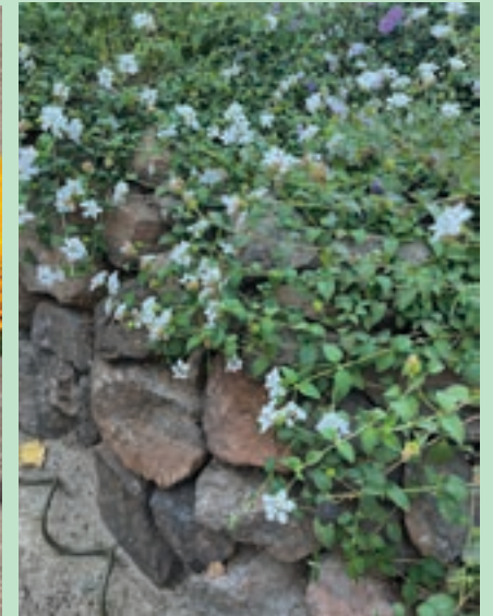
White lantana spills over a rock wall flower bed.