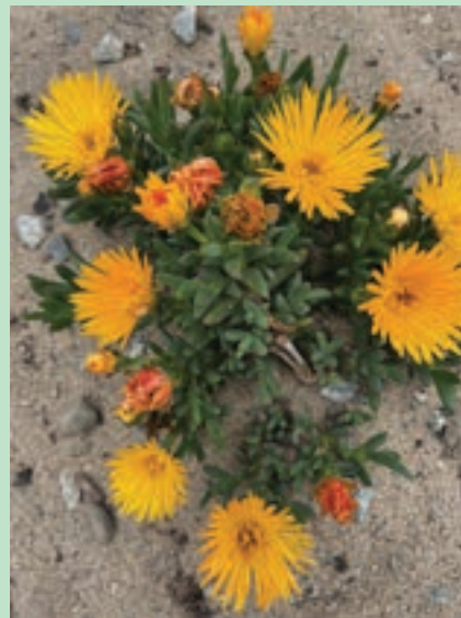
Yellow seaside ice plant grows in sand and gravel.