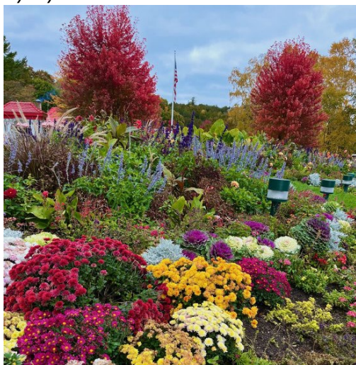
A glorious garden of mums and maples.

"Gratitude is the fairest blossom which springs from the soul." ~ Henry Ward Beecher