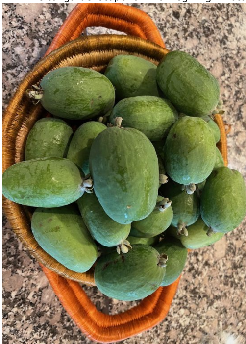
Gigantic green guavas will ripen on the counter.