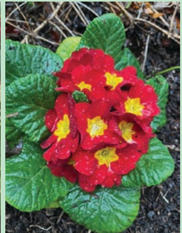
Primroses add needed color to the garden after the drizzle.