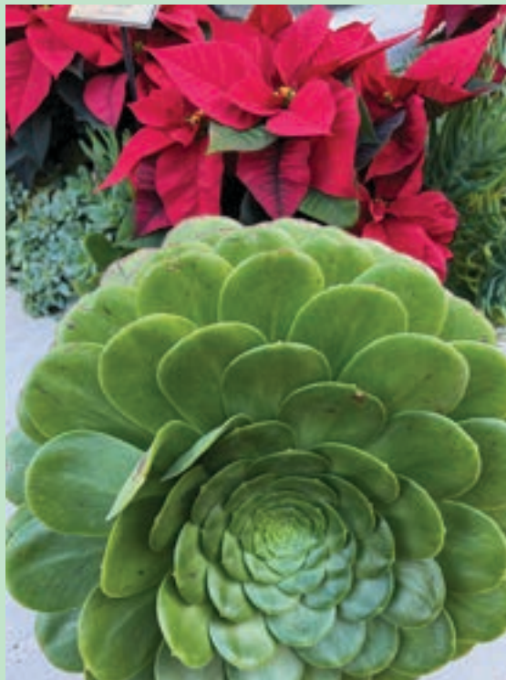
Aeonium succulent flanked by poinsettia.