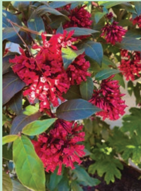
Crimson cestrum shines for December.

ROLL in the leaves. Tap into your inner child. Happy Gardening. Happy Growing.