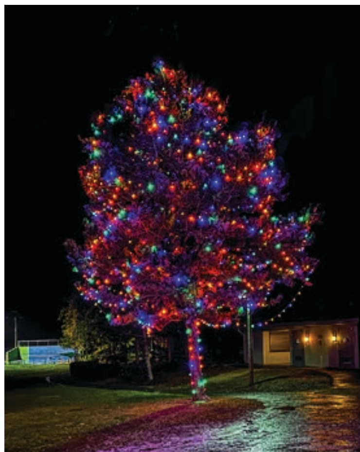
The second annual lighting of the tree in Orinda Community Park on Dec. 2.

event attracted a large crowd of attendees, but everything