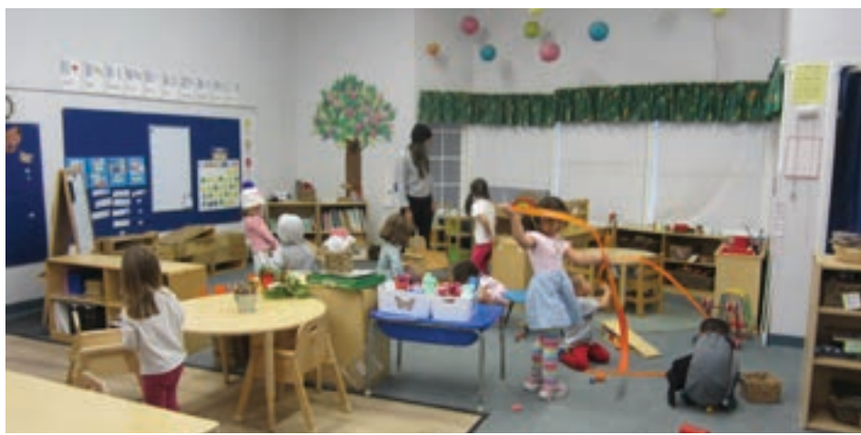
Children learn and play at The Child Day Schools-Moraga